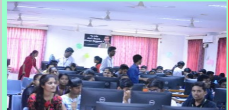
SIXTH SENSE ROBOTICS